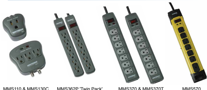
MMS110 & MMS130C